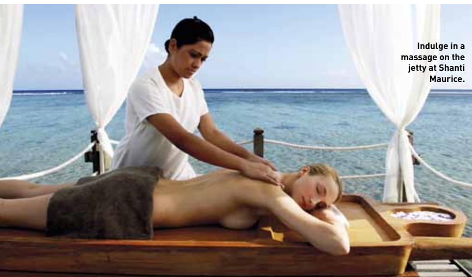
Indulge in a massage on the jetty at Shanti Maurice.

Voted Best Luxury Hotel Spa in Mauritius 2012, Shanti Maurice's spa is one of the largest on the island (7000 sq metres), with 25 beautifully appointed treatment rooms. The spa menu is so vast it reads more like a book, offering a harmonious union of Ayurvedic techniques and natural Africology products. Relieve any pre-wedding stress with a moonlight therapy, which includes a quartz massage under the stars to balance your chakras. After your day spa session, kick back in the enchanting tea pavilion, where you can sip herbal brews and soak up the tranquillity of the lily ponds and fragrant blooms.