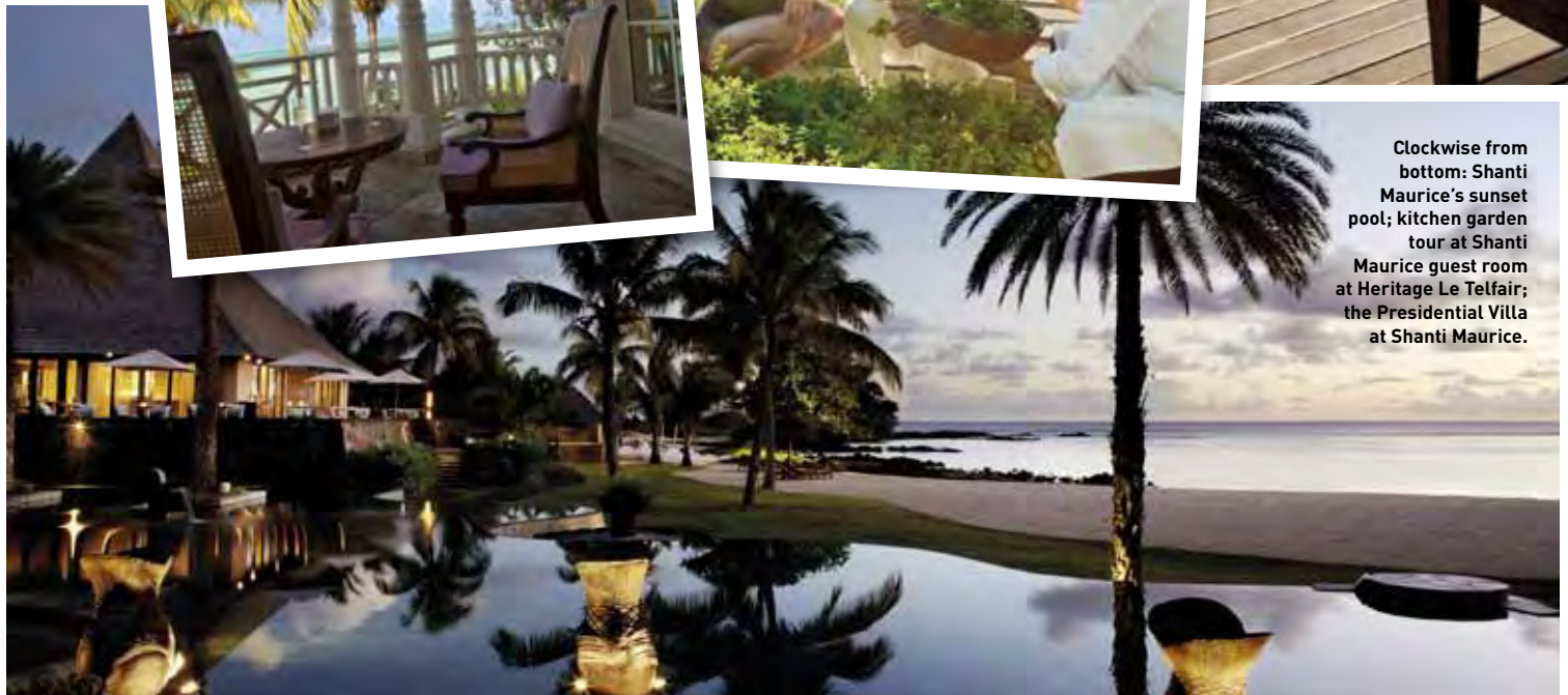
Clockwise from bottom: Shanti Maurice's sunset pool; kitchen garden tour at Shanti Maurice guest room at Heritage Le Telfair; the Presidential Villa at Shanti Maurice.