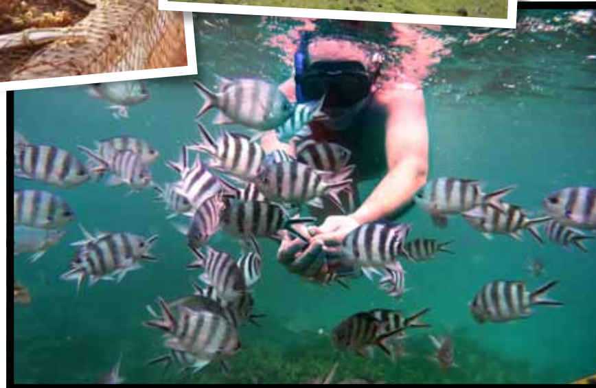
Clockwise from top: the turquoise Indian Ocean; quad biking in Frédérica Nature Reserve; snorkelling on the reef; the seafood shack on the beach at Shanti Maurice.